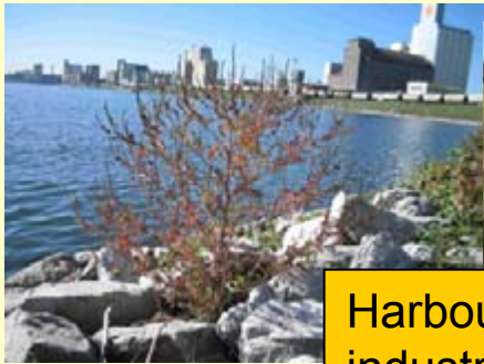
Harbours/ industrial areas