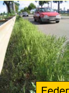
Federal highways, highways