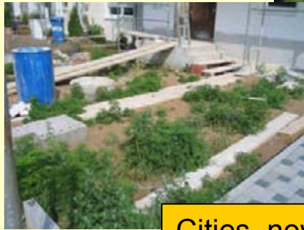
Cities, new settlements