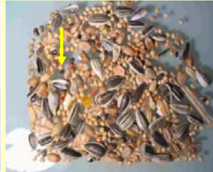
Bird-seed containing achenes